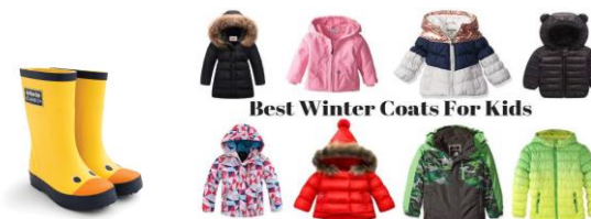
Best Winter Coats For Kids

As the weather is beginning to change and get wetter and colder, remember that we do learn outside in all weathers. They must have a waterproof coat and wellies in school at all times. Thank you.