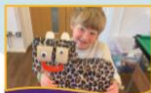
Arts and Craft