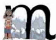
Maisie, mountain, mountain

use our new sounds to start to read words by ourselves. We have tried to write our new sounds using their special rhymes.